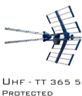
UHF - TT 365 5G PROTECTED