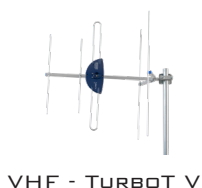
VHF - TURBOT V