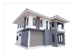
DOMESTIC INSTALLATIONS AND SMALL COLLECTIVE