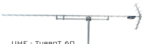
UHF - TURBOT 60