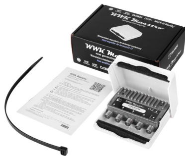
AMPLIFIER WWK MAESTRO