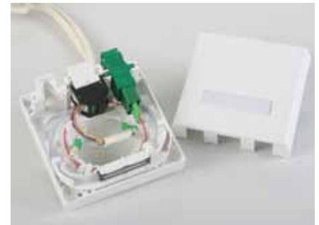
3M™ FTTH Wall Outlet 8686

The 3M™ FTTH Wall Outlet 8686 is compatible with round and FRP-type indoor drop cables with 30mm bend radius.